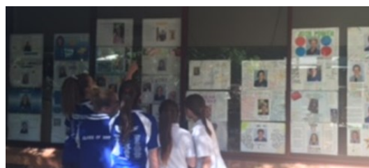
School Captain election posters