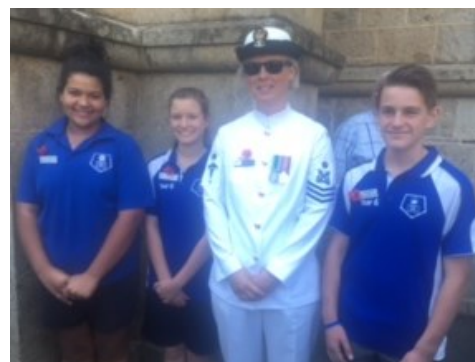
ANZAC Day Ceremony