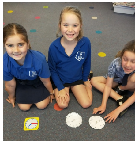
Coolibah students participating in teacher-guided, independent and point of need learning activities