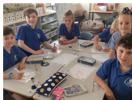
Grevillea students participating in independent and point of need learning activities